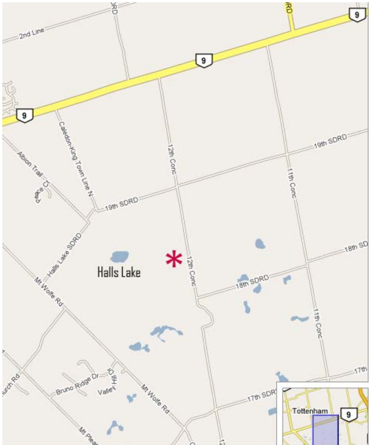
16540 12th Concession Road, King Township